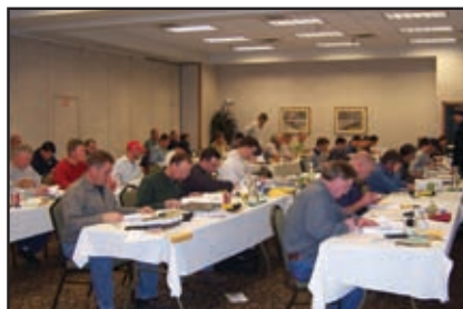
Bolton & Menk surveying staff taking the CST exam

began a training program for staff survey technicians to assist them in preparing for the certification exam.