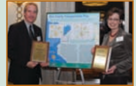
ACEC Awards Presentation

Rice County hired Bolton & Menk to guide the development of the County's first ever transportation plan. Bolton & Menk focused on improving the continuity of the system by creating a countywide roadway Continuity