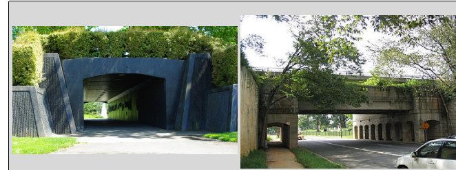
Ped / Trail Underpass Auto / Ped Underpass