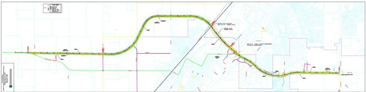
CSAH 1 Preferred Planning Alignment

CSAH 1 provides east–west travel through northern Rice County. The study purpose was to coordinate necessary planning for a continuous CSAH 1 Minor Arterial corridor with other roadway and land use planning activities in Dundas and southern Northfield, so a long–term sustainable roadway network could be achieved. The study recognized the efforts previously evaluated by the City of Northfield for the extension of Jefferson Parkway. It explains that this river crossing option would remain open until an environmental review can be completed to determine an appropriate Cannon River bridge location in the Northfield/Dundas area. The preferred planning alignment identified to be preserved for further planning, preservation, and environmental analysis was selected based on its ability to best accommodate the needs of the regional transportation system, local land use, and local transportation, while minimizing impacts on environmental and cultural resources. The preferred route selected is identified below.